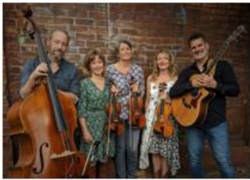
The Bow Tides: Free T-shirt, CD, Sticker, and 2 Tickets to a show of your choice! Show options: Chicago @ IAHC 2/28/25 or Milwaukee @ Shank Hall 3/1/25