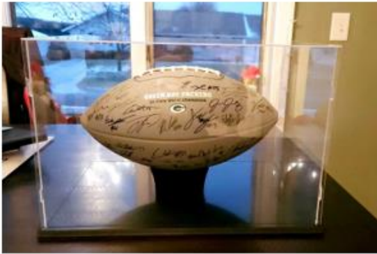
Signed Green Bay Packers football