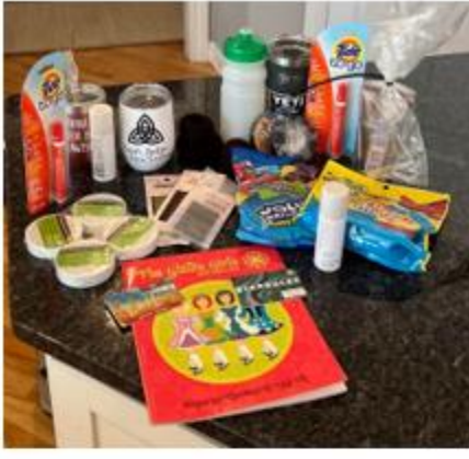
Feis Survival Basket: Feis Survival Basket ($50 GC to Kwik Trip, $15 GC to Starbucks, Irish dance storybook, 6 rolls of tape for shoes, 3 packs bobby pins, 2 bags candy, 2 bottles of hairspray, 2 containers of self-tan, one water bottle, 2 tide pens, 2 travel wine tumblers, 1 yeti coffee travel cup, 2 donuts, 1 pouf donut)