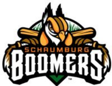
Schaumburg Boomers baseball 4 reserved tickets