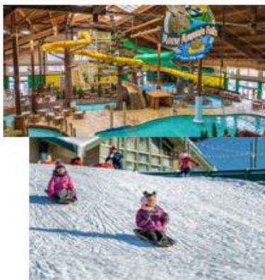
Hotel Accomodations for 1 night at The Grand Geneva