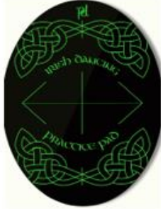
Irish dance practice pad from Irish Dance Pro