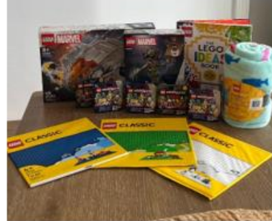
Lego Basket (Two Marvel lego sets, 5 minifigure sets, 3 baseplates, lego plush throw blanket, lego ideas book