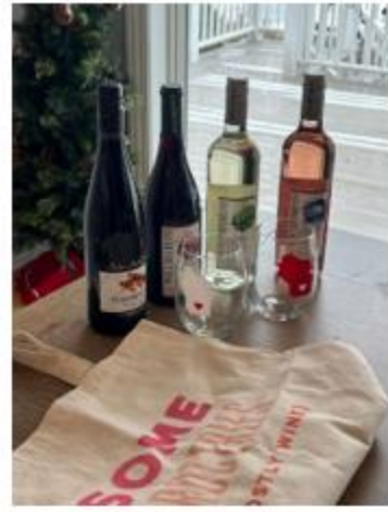
Wisconsin Wine Basket (4 bottles of Wisconsin wine wine tote bag, and two wine glasses)