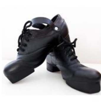
Pair of Hard Shoes from Touch of Ireland