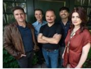
2 Gaelic Storm Concert tickets to the March 8 th show at The Barrymore