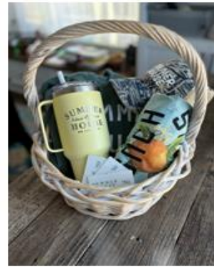
Summer House restaurant gift card for $150, YETI cup, hat, tshirt, & sweatshirt