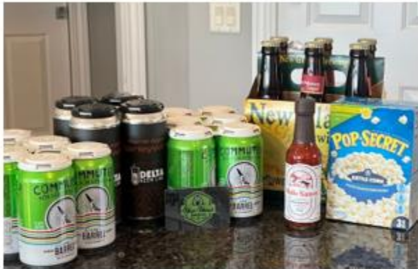
Wisconsin Craft Beer Basket: Beer from One Barrel, Delta Beer Lab, & New Glarus breweries. Also $25 GC to Hop Haus Brewing, bottle of hot sauce, microwave popcorn