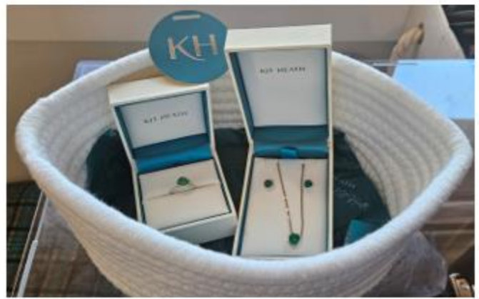
Jewelry from Goodman Jewelry. Kit Heath sterling silver necklace, earrings and ring. Green agate stone