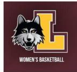
10 tickets to Loyola Women's basketball game Loyola vs Duquesne. Also swag included!