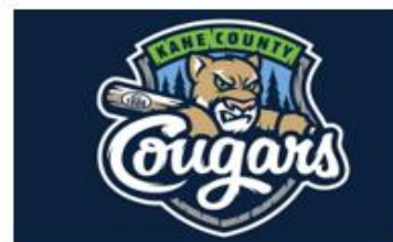
Kane County Cougars baseball 4 reserved tickets