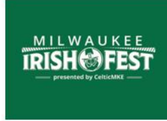
Milwaukee Weekend of Irish Fun (2 tickets to Irish Fest 2025 and 6 Best Place Pabst Beer History Tours