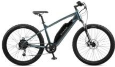
AN E-Bike! Roanoke 27.5 inch E Bike from Schwinn Thank you Madison gals for securing this!

Here is just a sample of the wonderful items that will be auction off at Winter Weekend. Keep an eye on Facebook as more items will be revealed this week.