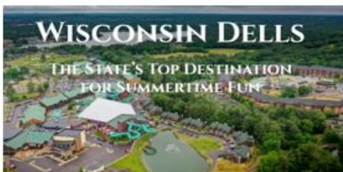
Dells Getaway Basket (GC to Wilderness, GC for free large pizza at Moose Jaw, 2 beach towels, $50 Kwik Trip GC)