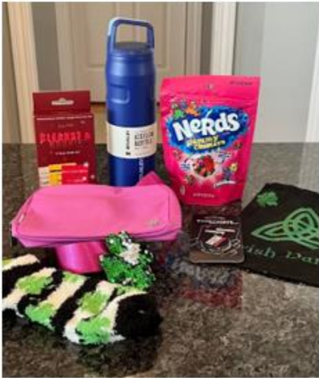
Teen/Tween basket featuring: key chain, face masks, pop socket, small bag, Stanley bottle, fuzzy socks, nerds clusters, & Lululemon belt bag