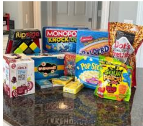
Family Game Night basket includes Flipside, Monopoly Knockout, Balderdash, Sleeping Queens, Be-Rhymed, Go fish, Pass and Match, War & Taco Cat Goat Cheese Pizza Games, Dots pretzels, Bubblr, popcorn, sour patch kids)