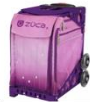
A Zuca!! Your choice of color & style!