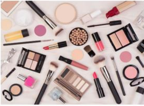
A complete set of TEAMS makeup !!